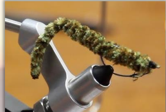
Rivers & Glen Trading Co.

Weight: 0.30 mm lead-free wire (optional)