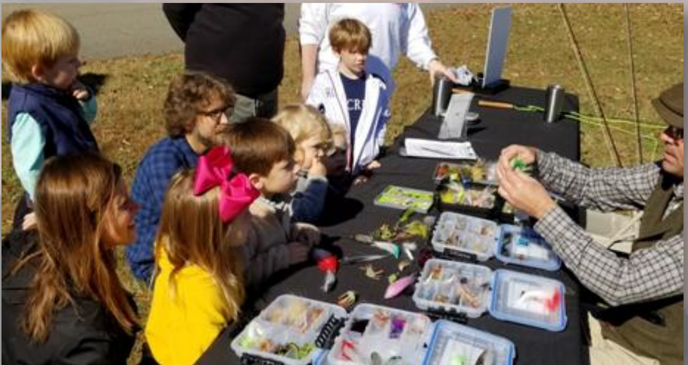
The kids and adults alike were all ears when it came to the flies

Estimated attendance was around 1500 – 2000 people and they had plenty of things to do with us and all the partners. There were things for all interests, from leaf presses, to composting tips, to hammocks for lounging around, and one our favorites was the entomology on display in the clubhouse. There were very large sized dragon fly nymphs, and other creatures pulled from the water's edge that you could examine under a microscope. There was great information about all the critters including our favorite nymphs and how their mouths were used as inspiration for the Alien in the Alien series of movies. We look forward to next years Fallen Leaf Festival and once again partnering with great organizations and friends.