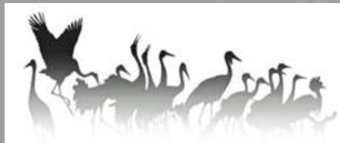
Saving cranes and the places where cranes dance!

To learn more about Whooping Cranes and the other 14 crane species supported through the work of the International Crane Foundation, go to www.savingcranes.org