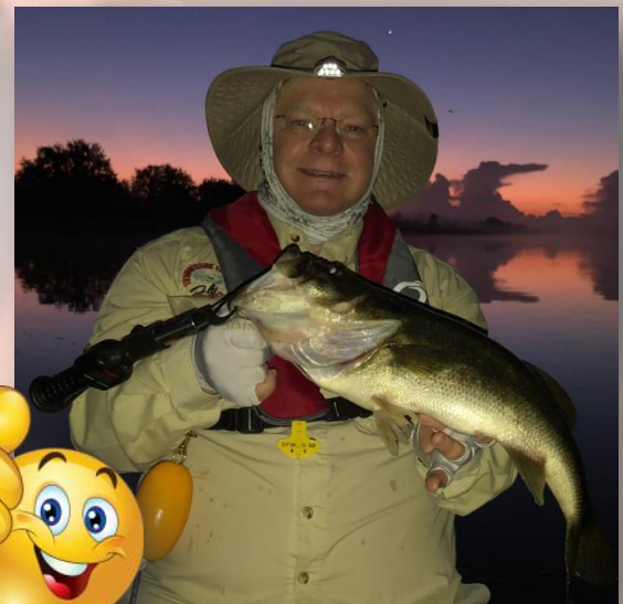
Great way to start your day