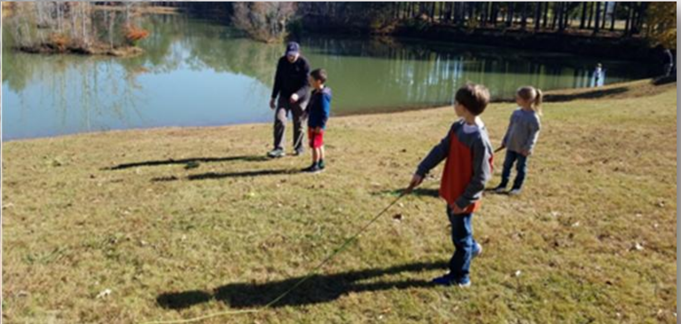
Some kids learning to enjoy this great sport