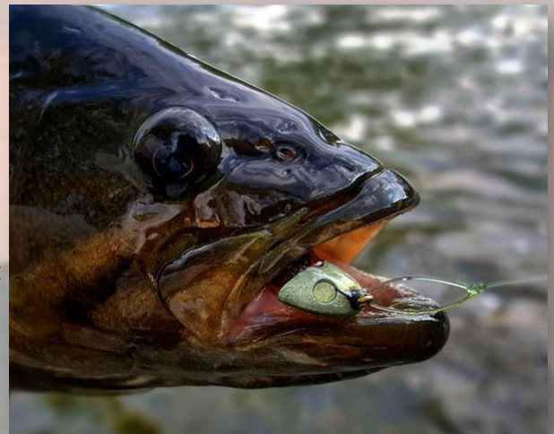
Fish-Skull Sculpin Helmets drop your fly into the feeding zone fast.