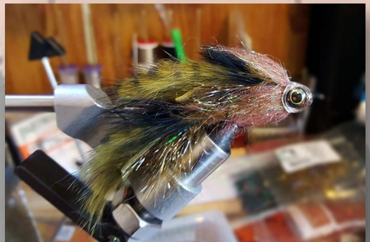
A Fish-Skull Fish-Mask and Living Eyes top off this articulated pattern.