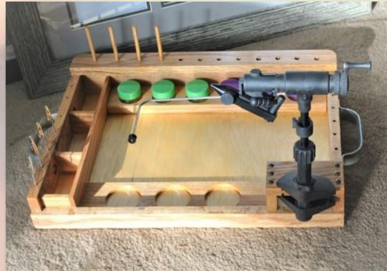
Left Handed Tyers