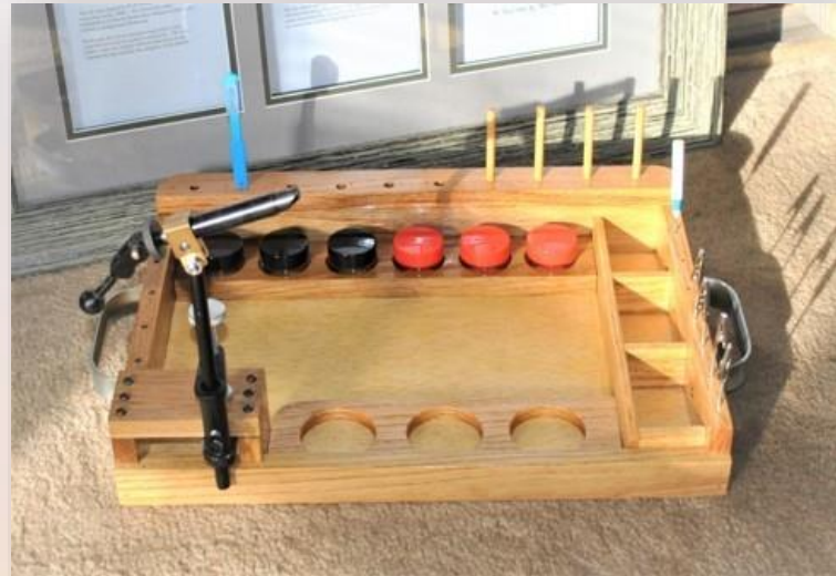
Right Handed Tyers