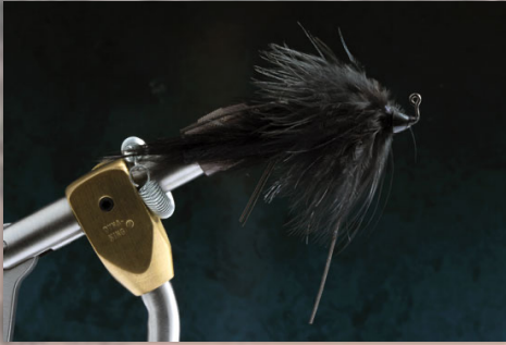
Barr's Meat Whistle

Your favorite fly when targeting any fish is very subjective. However, when it comes to Smallmouth Bass, there are a few flies that just seem to work more often than not. The following list of flies are Fly Fisherman Magazine's top flies for Smallies. Take note! Smallies are fun to catch. Full article can be found here , authored by Ben Romans.