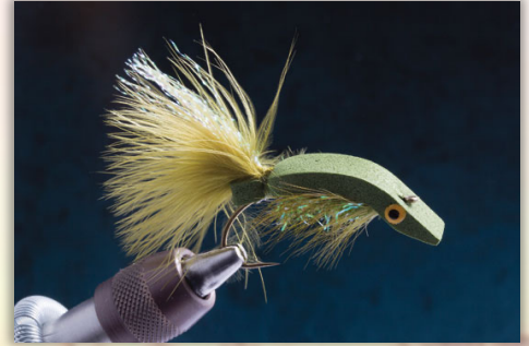
Tullis Wiggle Bug