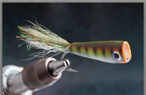
Blados' Crease Fly