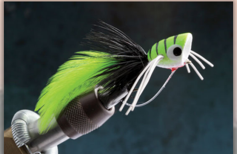
Cupped Mouth Popper